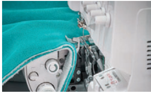
Advanced Knife Driving and One-Way Clutch System Baby Lock has created a knife system with a larger cutting bite that cuts thicker fabric with ease and increased visibility.