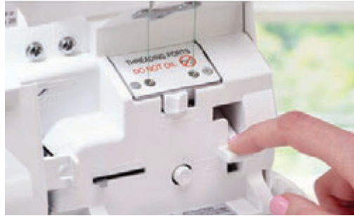
Jet-Air Threading™ With just the touch of a lever, thread is sent through the tubular loopers. There are no thread guides, no struggling and there's plenty of time to serge away!