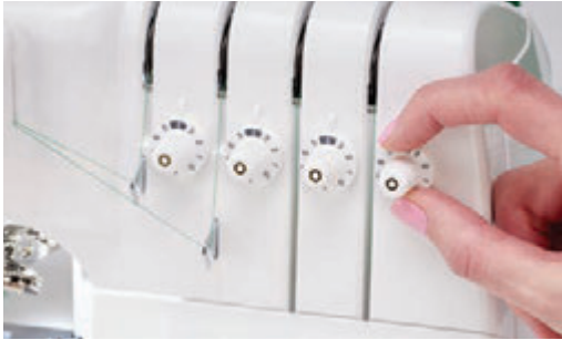
Micromatic Twin Cam Tension System Eliminates thread tangles and delivers proper tension with all threads on any fabric.