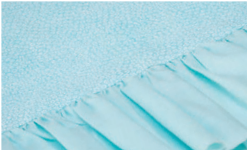
Full Featured Single Unit Differential Feed We've taken the differential feed to a new level by adding a single-unit feed dog mechanism. This ensures stronger feeding as well as consistent gathering on all fabrics.