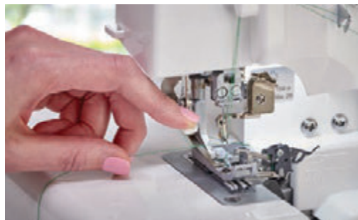
Needle Threading System Hold the needle threader in place for quick and easy threading with just the touch of a lever.